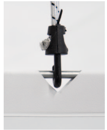
▲ Elastic stretchers detail

The product is sold with a kit of 20 cm elastic cables; kits for special installations are available on demand with 35 and 55 cm cables. In order to optimize the packaging and transportation of the screen, the iron rods to be inserted into the base are always divided into two halves; one-piece rods are also available for the other three sides, depending on the end user's individual requirements.